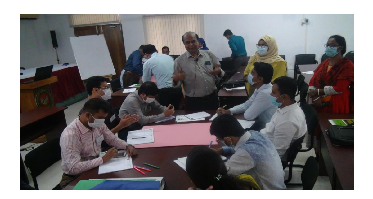
Participants busy for group works