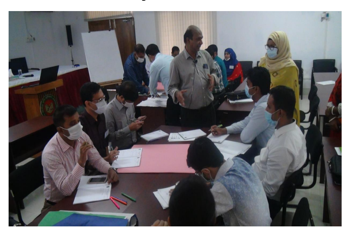
Group work discussion