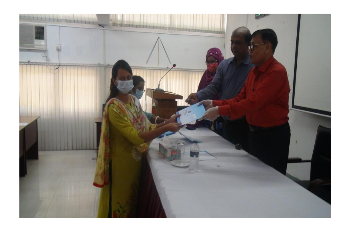
Certificate distribution among participants by Director (Admin) NATA