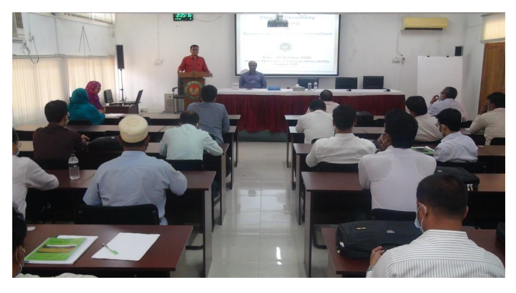
Closing ceremony addressed by Chief Guest, Director (Admin), NATA