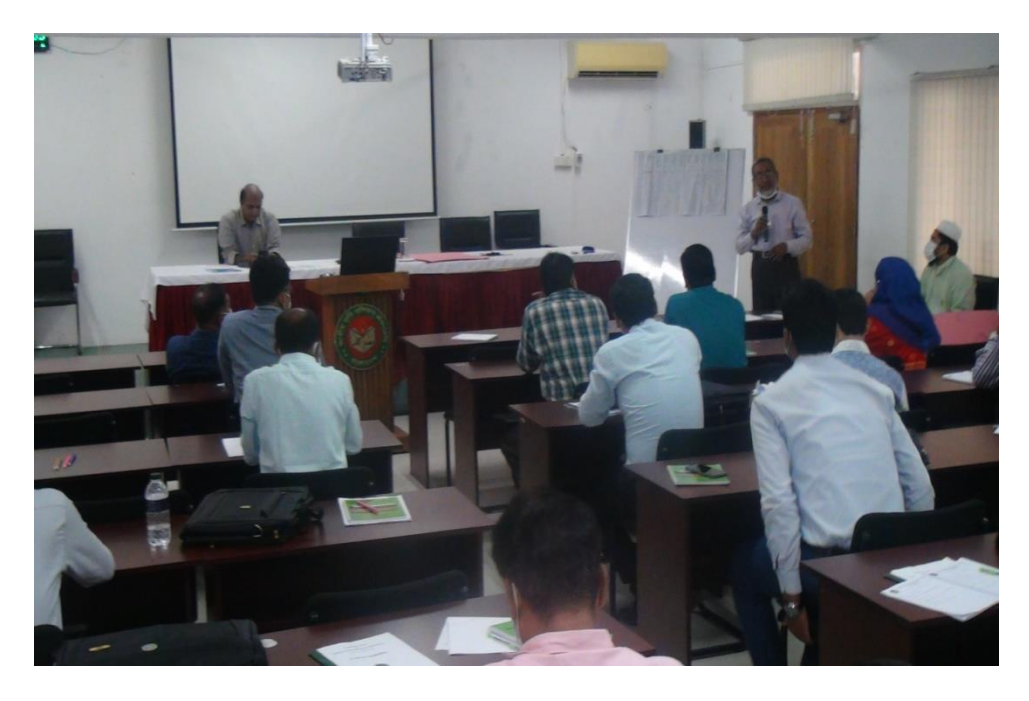
Group work presentation by group leader