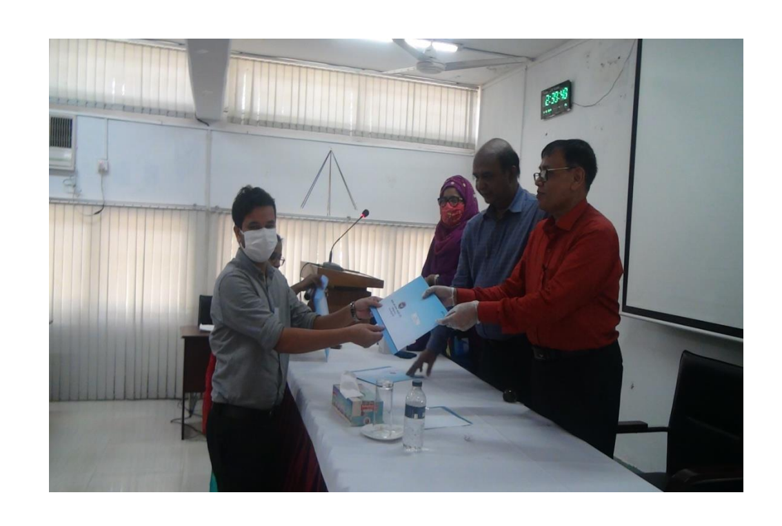
Certificate distribution among participants by Director Admin, NATA