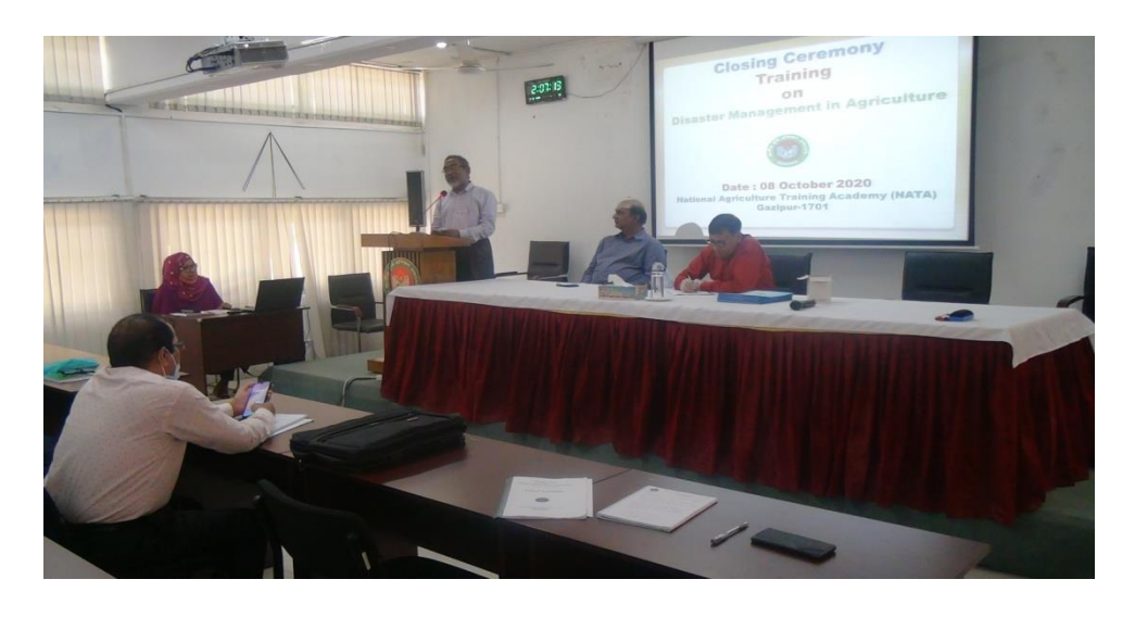
Closing ceremony addressed by Participant